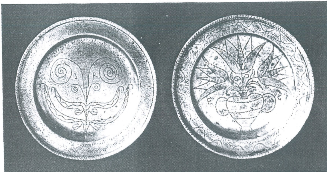
TWO FEWTER PLATES, DATED 1706 AND 1710 IN THE LONDON MUSEUM