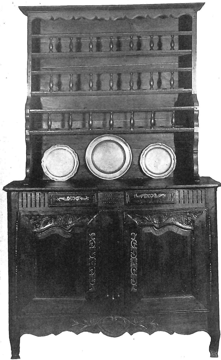
NORMANDY CARVED OAK DRESSER 18TH CENTURY [NUMBER 123]