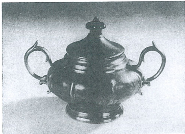
BRITANNIA SUGAR BOWL WITH COVER, by Gerhardt & Co. Height, 4¾ inches; diameter, 4½ inches; overall width 6½ inches. Detail of touch. Collection of Eric de Jonge.