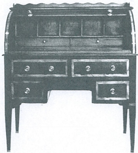
A mahogany roll-top child's bureau on square tapering legs, having four front drawers and five cubicles and two drawers inside. Ca.1780-90. 23¾" high, 21½" wide, 10½" deep.