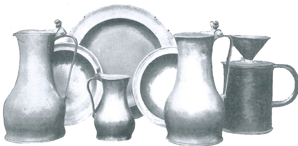
ST. LAWRENCE. PEWTER.