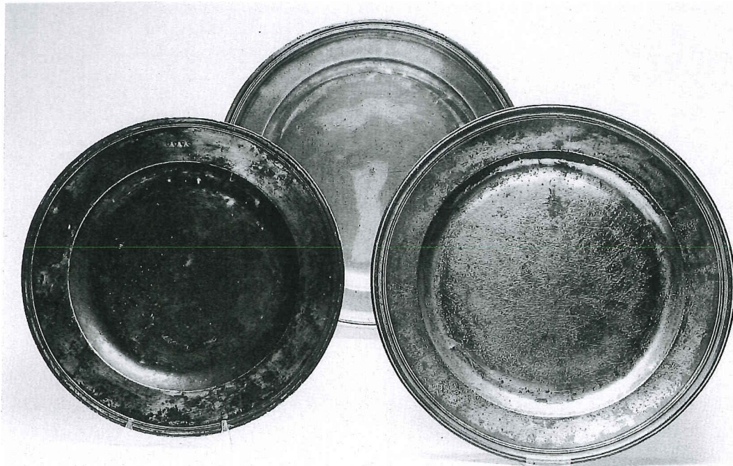
Lots 870, 871 and 872