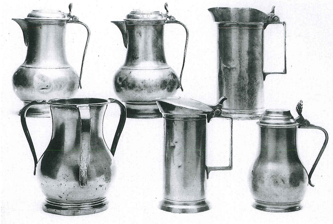
Lots 846, 847, 848 and 849