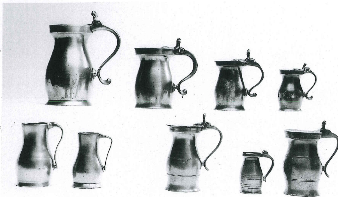
Lots 774, 775, 776, 777, 778, 779, 780 and 781