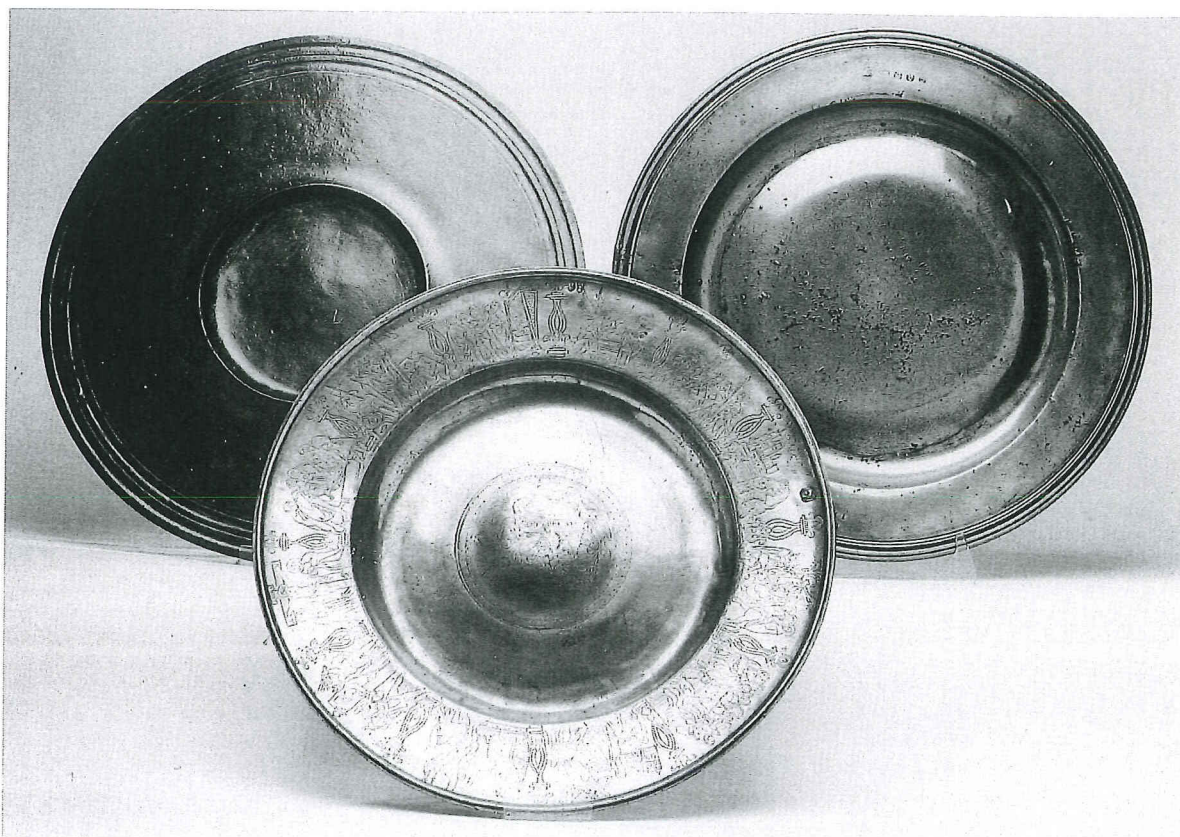
Lots 828, 829 and 830