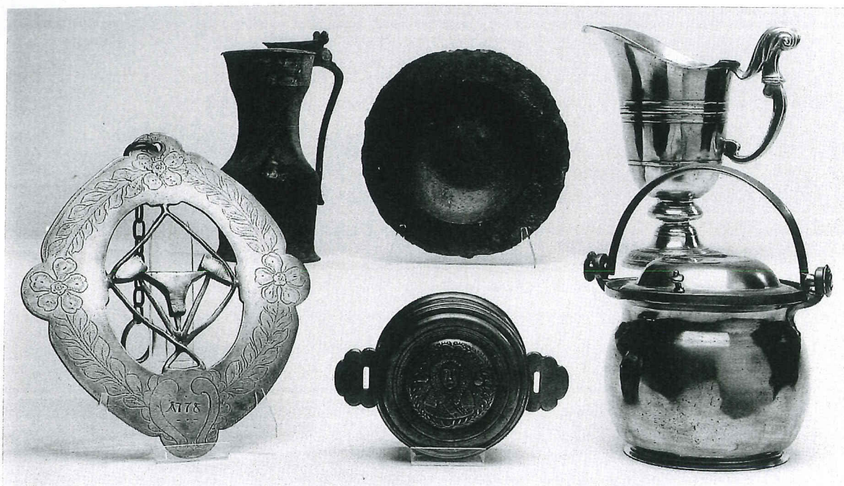
Lots 885, 886, 887, 888, 889 and 890

881 A 19th century Swedish spouted flagon, the tapering body with two bands of incised lines, the lid with heart shaped spout cover, ball thumbpiece and double curve handle, hallmarks to base height 26cm £150-200