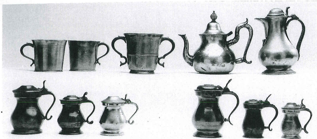
Lots 788, 789, 790, 791, 792 and 793