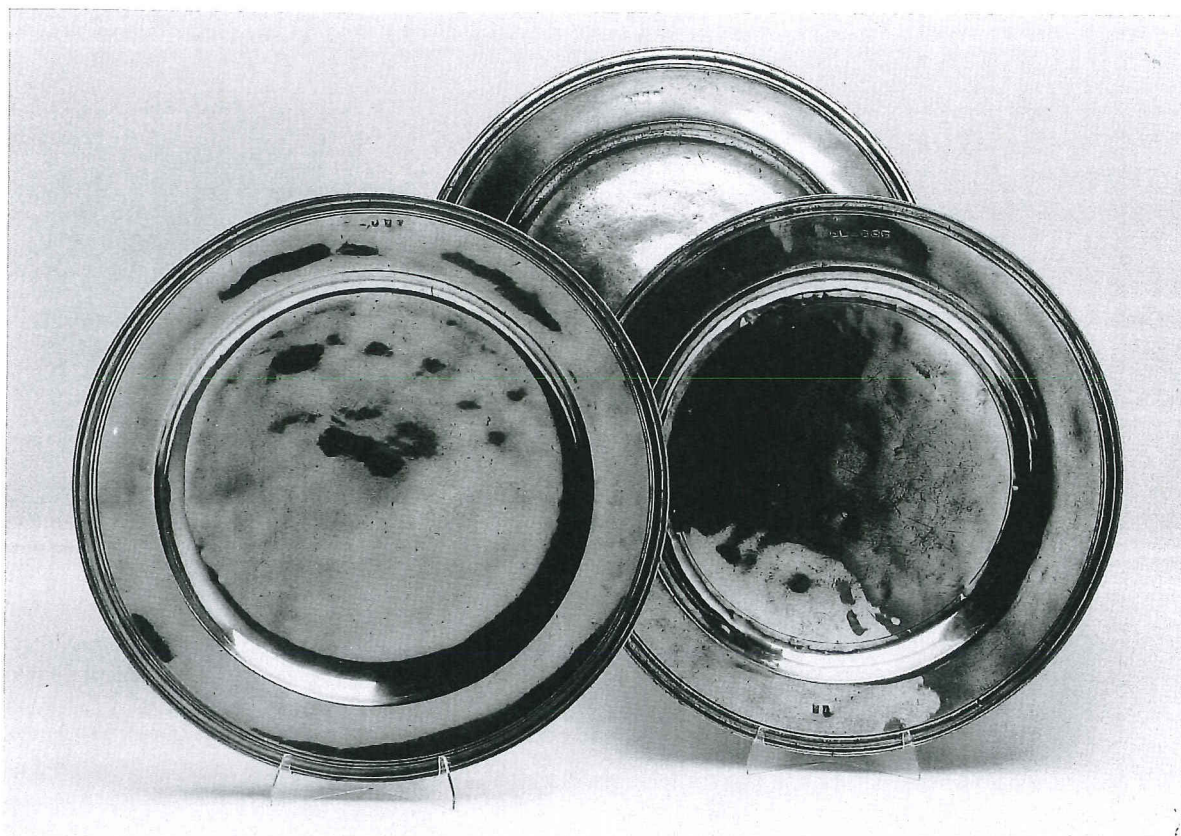
Lots 820, 821 and 822