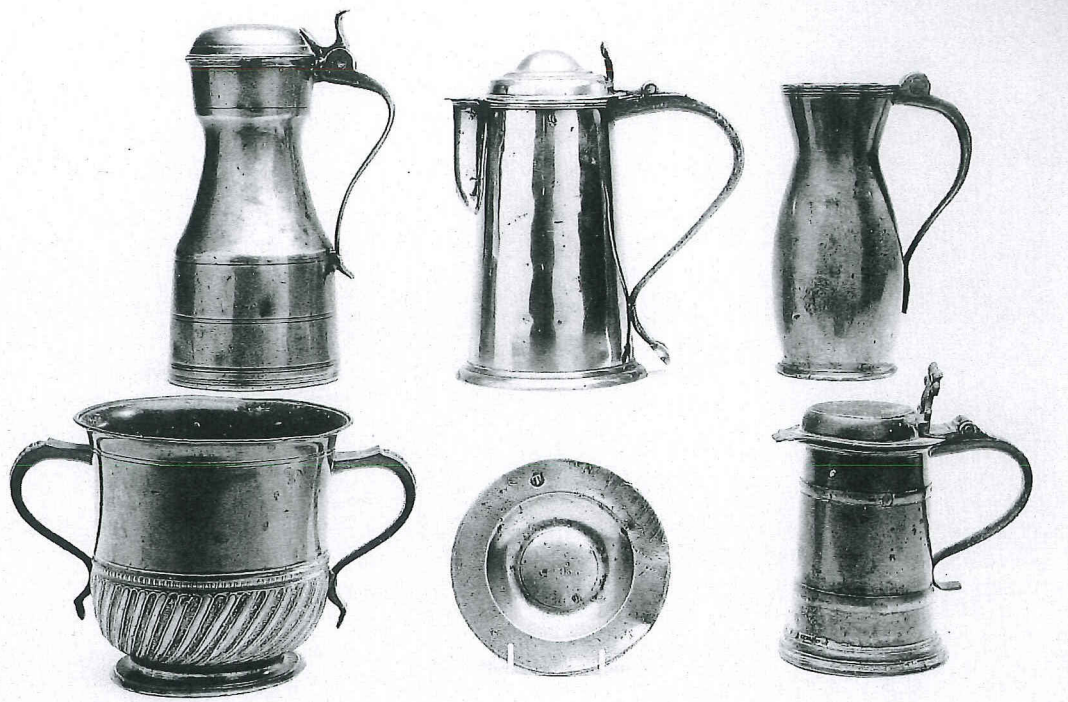
Lots 807, 808, 809, 810, 811 and 812