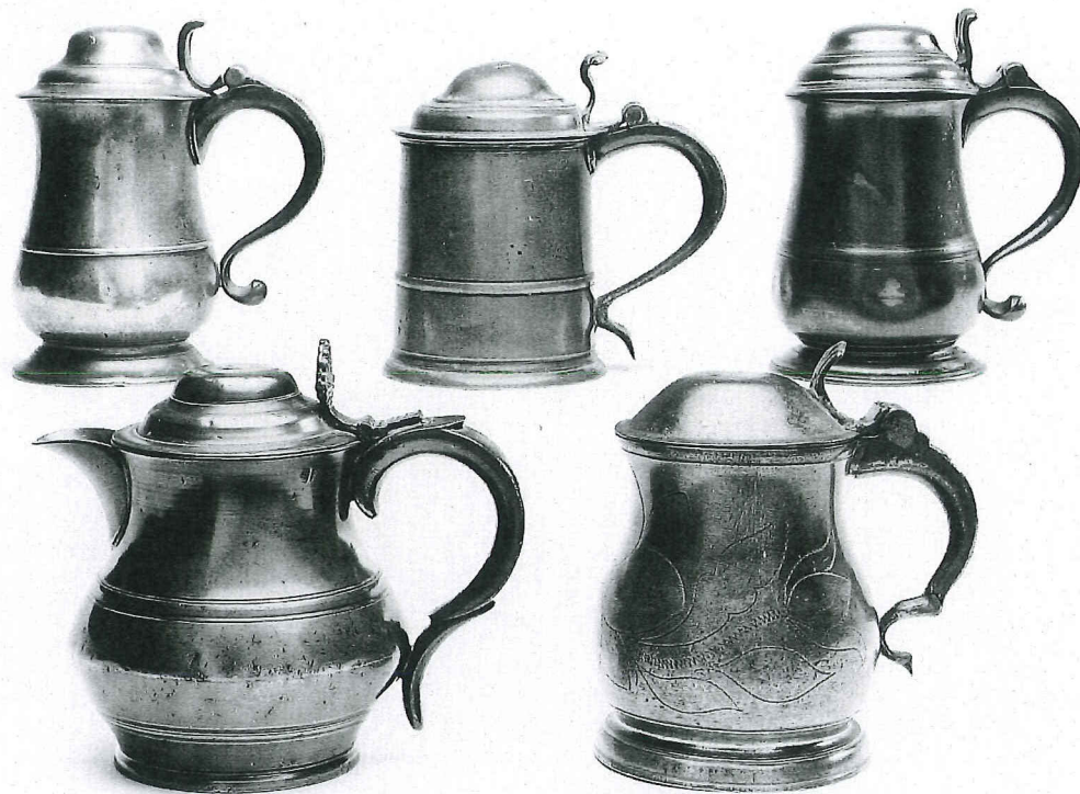
Lots 836, 837, 838, 839 and 840