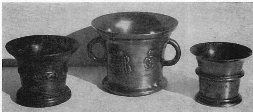
Above: Three of several brass, bell metal or bronze decorated Mortars of the seventeenth or eighteenth centuries. The largest is 5 in. high