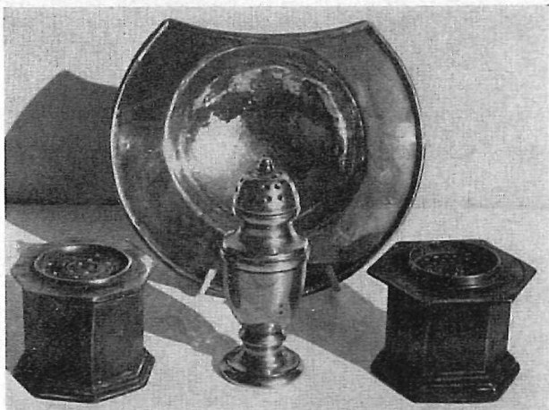
Small brass Barber's Bowl and brass Pepper Pot, circa 1800, with two unusual Pounce Pots in latten, circa 1700