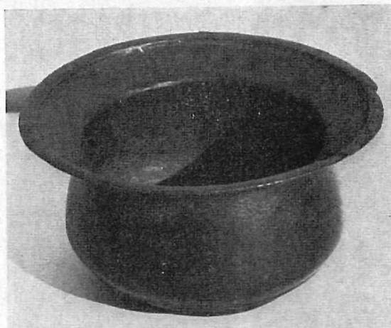
Rare early Bronze Bowl, excavated near Zwolle in Holland, circa 1400. (5½ in. diam)