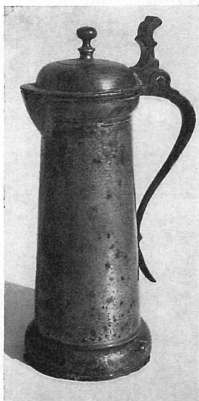
Left: Most unusual James I Flagon with lip, 13½ in. to thumbpiece. No maker's marks. A similar, but later Flagon is in the Victoria and Albert Museum.