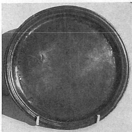
Narrow Rimmed Plate, one of the rarest of the seventeenth century style of platters. Circa 1680