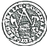
Figs. 1 and 2 — SEALS OF THE COOPERS' GUILD OF RATZEBURG (1660, left; 1793, above)

Turning now to the pewter vessels: standing twenty-seven inches high, in the centre of Figure 3, is the guild cup, or Wilkommen , supported upon four couchant lions. Gesticulating from a barrel-shaped knob centred in the top of the curiously domed cover, the tiny figure of a man in the costume of the period probably represents a typical guild member. Originally his outstretched hand sustained a banner, upon which was probably displayed the device of the guild.