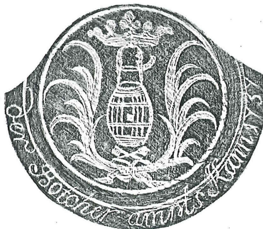
Fig. 7 — ENGRAVING ON THE LID OF THE LARGE FLAGON OF FIGURE 5 (reduced)