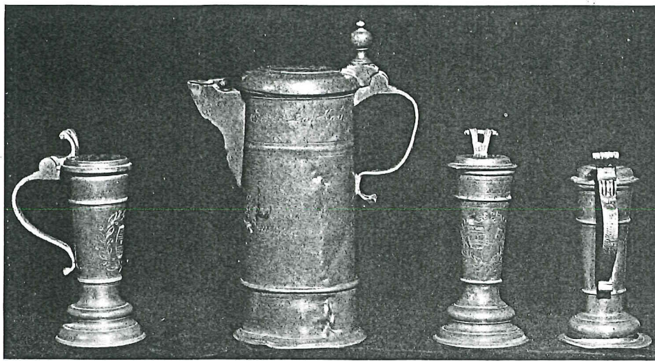
Fig. 5 — MORE PEWTER OF THE COOPERS' GUILD In the centre a thirteen-inch flagon dated 1737. The relief decoration of its strap handle is shown in duplicate at right and left, as Figure 6. The small flagon at the left is dated 1832; that second from the right, 1687