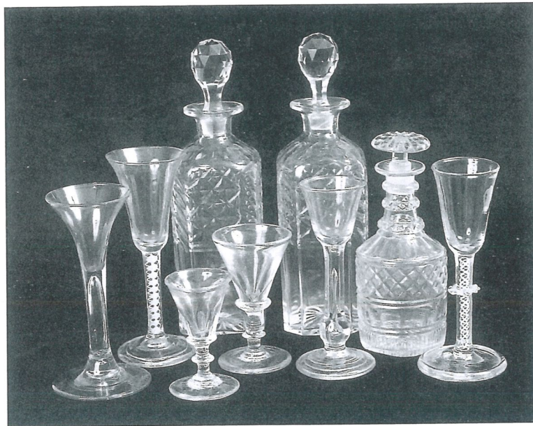
Private Collection of Wine Glasses and Decanters.