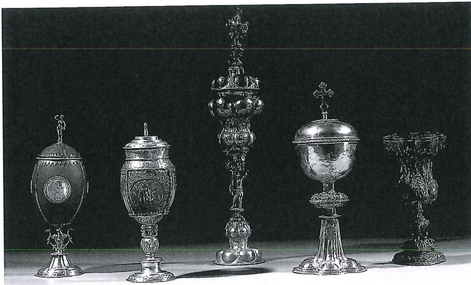
133, 134, 135, 136, 137