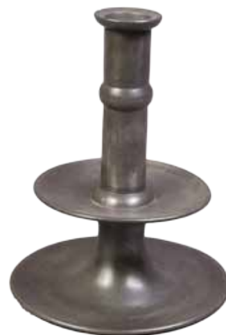
Above: A Mid 17th Century English trumpet based pewter candlestick.