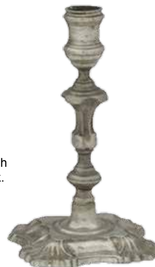
Right: George II Pewter Candlestick, Circa 1750 By Alexander Cleeve II, London.