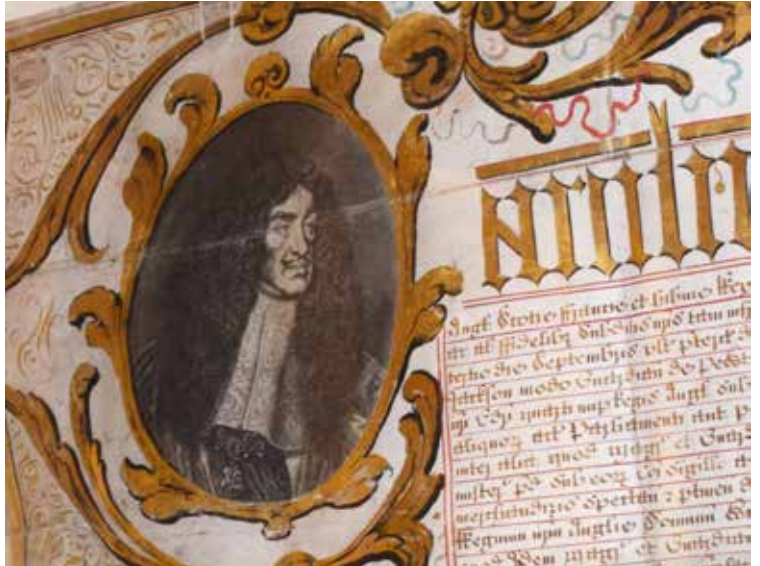
Detail of the Company's Charles II Charter

The styles defined as Baroque and Rococo were prevalent in Europe from the early 17th until the late 18th century. Their stylistic qualities went far beyond whim and fashion, as their opulence was, it could be argued, a tactic used by political and religious groups. An example of this would be Charles I adoption of Baroque style as, although his son is credited with the Restoration and all things