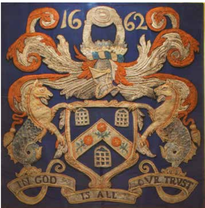
The Company's barge cloth 1662.

The Restoration of Charles II with full pomp and ceremony was welcomed by the same people who had shunned the monarchy. Livery Companies would have grappled with guilt along with the rest of