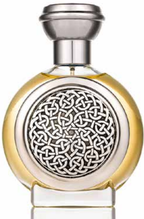
Above: Perfume by Boadicea the Victorious. The pewter was produced by A E Williams of Birmingham.